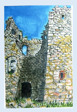
Plunton, Dumfries and Galloway